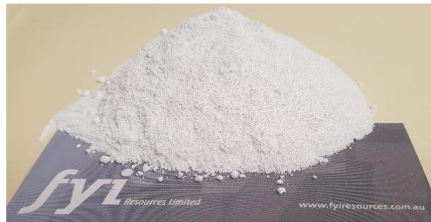
FYI Resources 99.999% (5N) high purity alumina

The test work is designed to provide data and information from the process flowsheet results of the laboratory-based test work as a "replication" of the full scale (production sized) process design.