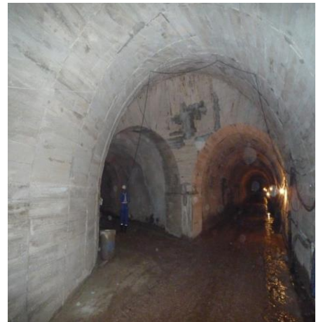
Thong Mang Potash Mine - underground access and development drives

This review is expected to commence on Tuesday, 26 April 2016.