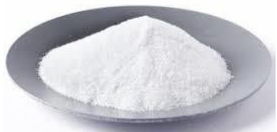
High Purity Alumina ( \text{Al}_2\text{O}_3 )

HPA ( \text{Al}_2\text{O}_3 ) is a high purity non-metallurgical alumina product with a higher finished aluminium grade than 99.9% (3N). HPA is categorised on the basis of purity level (i.e. 99.99% (4N), 99.999% (5N)) and of its application. The average price received for HPA increases commensurate with the escalation in purity level. HPA has beneficial characteristics especially suited to rapidly developing high tech markets. These qualities include superior hardness, low density, geothermal and electrical conductivity and high corrosion resistance.