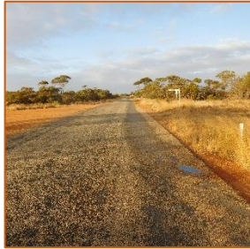
Major sealed road