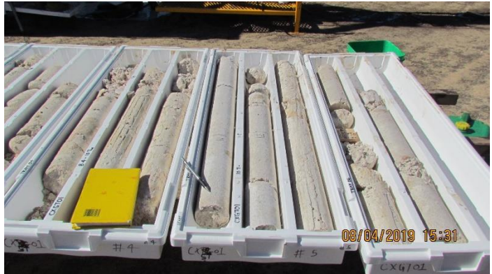
Diamond drill core from Cadoux kaolin project April 2019