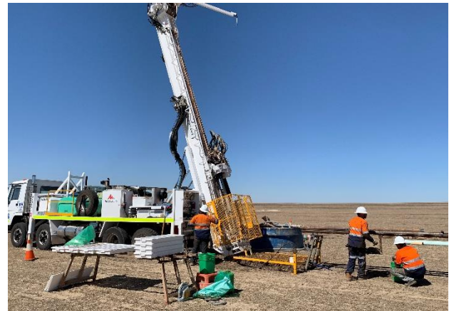
Diamond drilling at Cadoux kaolin project April 2019

The results of the analysis reflects the demonstrated high quality of the Cadoux kaolin and its potential for feedstock for HPA.