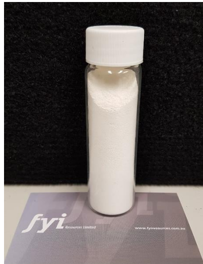
FYI produced HPA (99.99% Al 2 O 3 )

IMO is also finalising a supplementary stage of testwork following the completion of the scoping study testwork program to develop and trial a robust recirculating stream flowsheet through 'Locked Cycle' testing to improve the refining process efficiencies and economics.